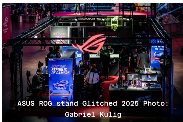
ASUS ROG stand Glitched 2025